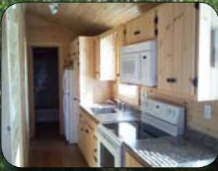
•Fully Applianced Kitchen