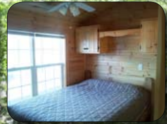
•Master Bedroom & Bunk Room